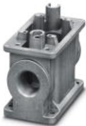
HEAVYCON ADVANCE B6 box mounting base, for M6 screw locking, salt-water-resistant aluminum, with 2 x M20 thread, without surface coating

Please be informed that the data shown in this PDF Document is generated from our Online Catalog. Please find the complete data in the user's documentation. Our General Terms of Use for Downloads are valid ( http://download.phoenixcontact.com )