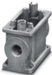
HEAVYCON ADVANCE B10 coupling housing, for M6 screw locking, salt-water-resistant aluminum, with 1 x M20 thread, straight cable outlet, without surface coating

Please be informed that the data shown in this PDF Document is generated from our Online Catalog. Please find the complete data in the user's documentation. Our General Terms of Use for Downloads are valid ( http://download.phoenixcontact.com )