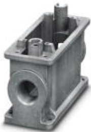
HEAVYCON ADVANCE B16 box mounting base, for M6 screw locking, salt-water-resistant aluminum, with 2 x M32 thread, without surface coating

Please be informed that the data shown in this PDF Document is generated from our Online Catalog. Please find the complete data in the user's documentation. Our General Terms of Use for Downloads are valid ( http://download.phoenixcontact.com )