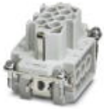
HEAVYCON female insert, B6 series, 6-pos., screw connection

Contact insert - HC-B 6-I-UT-F - 1648128