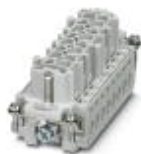
HEAVYCON female insert, B16 series, 16-pos., screw connection

Contact insert - HC-B 16-I-UT-F - 1648241