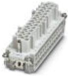
HEAVYCON female insert, B24 series, 24-pos., screw connection

Contact insert - HC-B 24-I-UT-F - 1648306