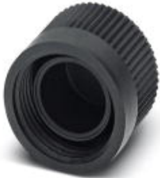
Sealing cap, 7/8", plastic, for sensor cables, for 7/8" plugs

Please be informed that the data shown in this PDF Document is generated from our Online Catalog. Please find the complete data in the user's documentation. Our General Terms of Use for Downloads are valid ( http://phoenixcontact.com/download )