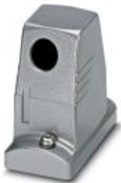
HEAVYCON ADVANCE standard powder-coated B10 sleeve housing, with screw locking, height: 100 mm, with 1 x M40 thread, lateral cable outlet

Please be informed that the data shown in this PDF Document is generated from our Online Catalog. Please find the complete data in the user's documentation. Our General Terms of Use for Downloads are valid ( http://phoenixcontact.com/download )