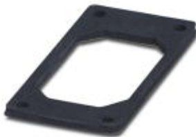
Flange seal, for HEAVYCON type B6 panel mounting base, self-adhesive, foam rubber made from cellular rubber, color: black

Please be informed that the data shown in this PDF Document is generated from our Online Catalog. Please find the complete data in the user's documentation. Our General Terms of Use for Downloads are valid ( http://phoenixcontact.com/download )