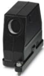
HEAVYCON B16 sleeve housing, HPR series, with screw locking, with M32 thread, lateral outlet, for increased environmental and EMC requirements

Please be informed that the data shown in this PDF Document is generated from our Online Catalog. Please find the complete data in the user's documentation. Our General Terms of Use for Downloads are valid ( http://phoenixcontact.com/download )