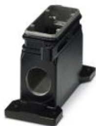
HEAVYCON B10 box mounting base, for screw locking, HPR series, with 2 x M32 gland, for increased environmental and EMC requirements

Please be informed that the data shown in this PDF Document is generated from our Online Catalog. Please find the complete data in the user's documentation. Our General Terms of Use for Downloads are valid ( http://phoenixcontact.com/download )