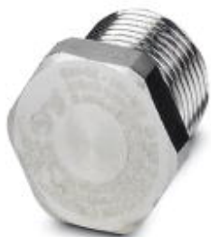
Screw plug, Nickel-plated brass, Application: Ex, Connecting thread: M20, Color: silver

Please be informed that the data shown in this PDF Document is generated from our Online Catalog. Please find the complete data in the user's documentation. Our General Terms of Use for Downloads are valid ( http://phoenixcontact.com/download )