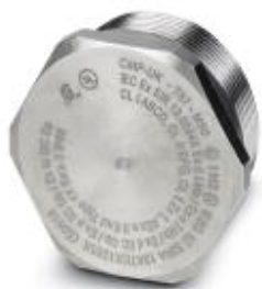
Screw plug, Nickel-plated brass, Application: Ex, Connecting thread: M40, Color: silver

Please be informed that the data shown in this PDF Document is generated from our Online Catalog. Please find the complete data in the user's documentation. Our General Terms of Use for Downloads are valid ( http://phoenixcontact.com/download )