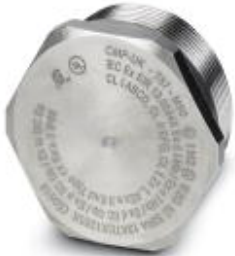
Screw plug, Nickel-plated brass, Application: Ex, Connecting thread: M50, Color: silver

Please be informed that the data shown in this PDF Document is generated from our Online Catalog. Please find the complete data in the user's documentation. Our General Terms of Use for Downloads are valid ( http://phoenixcontact.com/download )