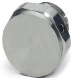
Pressure compensation element, Nickel-plated brass, Application: Ex, Connecting thread: M20, Color: silver

Please be informed that the data shown in this PDF Document is generated from our Online Catalog. Please find the complete data in the user's documentation. Our General Terms of Use for Downloads are valid ( http://phoenixcontact.com/download )