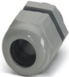
Cable gland, Cable gland material: Polyamide 6, External cable diameter 5 mm ... 10 mm, Shielding: No, Connecting thread: Pg11

Please be informed that the data shown in this PDF Document is generated from our Online Catalog. Please find the complete data in the user's documentation. Our General Terms of Use for Downloads are valid ( http://phoenixcontact.com/download )