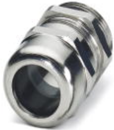
Cable gland, Cable gland material: Brass, nickel-plated, External cable diameter 5 mm ... 10 mm, Shielding: No, Connecting thread: NPT3/8 inch, Color: silver

Please be informed that the data shown in this PDF Document is generated from our Online Catalog. Please find the complete data in the user's documentation. Our General Terms of Use for Downloads are valid ( http://phoenixcontact.com/download )