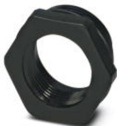
Reducing adapter, plastic, M25 to M20, including O-ring

Please be informed that the data shown in this PDF Document is generated from our Online Catalog. Please find the complete data in the user's documentation. Our General Terms of Use for Downloads are valid ( http://phoenixcontact.com/download )