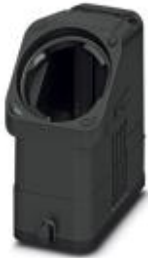
HEAVYCON EVO sleeve housing, plastic, with bayonet flange for EVO screw connection, D15 series, for single locking latch, height: 65.5 mm, without EVO screw connection

Please be informed that the data shown in this PDF Document is generated from our Online Catalog. Please find the complete data in the user's documentation. Our General Terms of Use for Downloads are valid ( http://phoenixcontact.com/download )