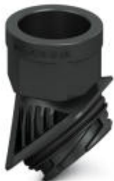
EVO plastic adapter with bayonet locking, for EVO housing series D, for 3/4" NPT screw connections.

Please be informed that the data shown in this PDF Document is generated from our Online Catalog. Please find the complete data in the user's documentation. Our General Terms of Use for Downloads are valid ( http://phoenixcontact.com/download )