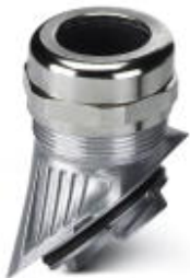
EVO metal cable gland with bayonet locking, B series, size M40, cable diameter: 19 - 27 mm

Please be informed that the data shown in this PDF Document is generated from our Online Catalog. Please find the complete data in the user's documentation. Our General Terms of Use for Downloads are valid ( http://phoenixcontact.com/download )