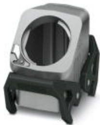
HEAVYCON EVO sleeve housing, EMC version, without powder coating, with bayonet flange for EVO screw connection, B10, with double locking latch, height: 64 mm, without EVO screw connection.

Please be informed that the data shown in this PDF Document is generated from our Online Catalog. Please find the complete data in the user's documentation. Our General Terms of Use for Downloads are valid ( http://phoenixcontact.com/download )