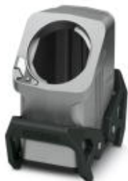
HEAVYCON EVO coupling housing, EMC version, without powder coating, with bayonet flange for EVO screw connection, B10, with double locking latch, height: 83 mm, without EVO screw connection.

Please be informed that the data shown in this PDF Document is generated from our Online Catalog. Please find the complete data in the user's documentation. Our General Terms of Use for Downloads are valid ( http://phoenixcontact.com/download )