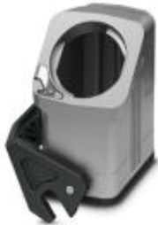
HEAVYCON EVO coupling housing, EMC version, without powder coating, with bayonet flange for EVO screw connection, B10, with single locking latch, height: 83 mm, without EVO screw connection.

Please be informed that the data shown in this PDF Document is generated from our Online Catalog. Please find the complete data in the user's documentation. Our General Terms of Use for Downloads are valid ( http://phoenixcontact.com/download )