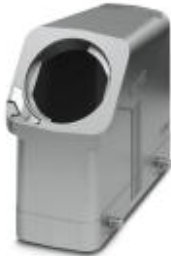
HEAVYCON EVO sleeve housing, EMC version, without powder coating, with bayonet flange for EVO screw connection, B24, for double locking latch, height: 88 mm, without EVO screw connection.

Please be informed that the data shown in this PDF Document is generated from our Online Catalog. Please find the complete data in the user's documentation. Our General Terms of Use for Downloads are valid ( http://phoenixcontact.com/download )