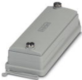
HEAVYCON ADVANCE, IP66, B16 protective cover, for panel mounting side, with screw locking, with retaining cord, diameter of retaining cord eyelet: 3 mm

Please be informed that the data shown in this PDF Document is generated from our Online Catalog. Please find the complete data in the user's documentation. Our General Terms of Use for Downloads are valid ( http://phoenixcontact.com/download )