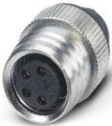
Sensor/actuator flush-type socket, 3-pos., M8, with straight solder connection

Please be informed that the data shown in this PDF Document is generated from our Online Catalog. Please find the complete data in the user's documentation. Our General Terms of Use for Downloads are valid ( http://download.phoenixcontact.com )