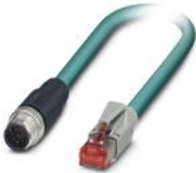
Assembled Ethernet cable, shielded, 4-pair, AWG 26 stranded (7-wire), RAL 5021 (sea blue), M12 plug to RJ45 plug/IP20, line, length 5 m

Please be informed that the data shown in this PDF Document is generated from our Online Catalog. Please find the complete data in the user's documentation. Our General Terms of Use for Downloads are valid ( http://download.phoenixcontact.com )