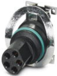
Flush-type connector, Universal, 5-position, SocketLink:straightLink:M8, B-coded, PCB mounting, SMD

Please be informed that the data shown in this PDF Document is generated from our Online Catalog. Please find the complete data in the user's documentation. Our General Terms of Use for Downloads are valid ( http://phoenixcontact.com/download )