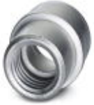
M8 socket, press-in mounting

Housing screw connection - SACC-FP-F-M8/PRESS SMD - 1412501