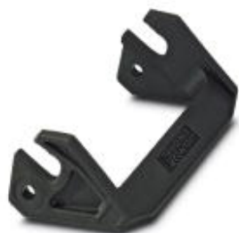
Single locking latch for B16 housing, HC-EVO....AL and HC-STA....AL

Please be informed that the data shown in this PDF Document is generated from our Online Catalog. Please find the complete data in the user's documentation. Our General Terms of Use for Downloads are valid ( http://phoenixcontact.com/download )