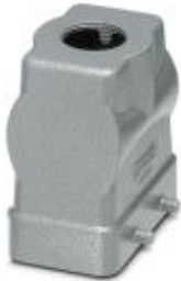
HEAVYCON sleeve housing B10, for double locking latch, height 72 mm, with thread 2x M20, straight conductor exit

Please be informed that the data shown in this PDF Document is generated from our Online Catalog. Please find the complete data in the user's documentation. Our General Terms of Use for Downloads are valid ( http://phoenixcontact.com/download )