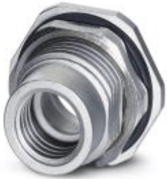
M8 socket, rear mounting

Please be informed that the data shown in this PDF Document is generated from our Online Catalog. Please find the complete data in the user's documentation. Our General Terms of Use for Downloads are valid ( http://phoenixcontact.com/download )