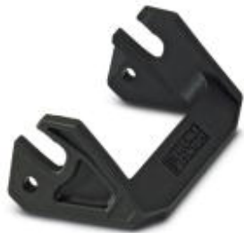
Single locking latch for B10 housing, HC-EVO....AL and HC-STA....AL

Please be informed that the data shown in this PDF Document is generated from our Online Catalog. Please find the complete data in the user's documentation. Our General Terms of Use for Downloads are valid ( http://phoenixcontact.com/download )