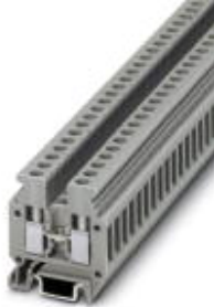
Feed-through terminal block, Connection method: Screw connection, Cross section: 0.2 mm 2 - 4 mm 2 , AWG 24 - 12, Width: 5.2 mm, Color: gray, Mounting type: NS 15

Please be informed that the data shown in this PDF Document is generated from our Online Catalog. Please find the complete data in the user's documentation. Our General Terms of Use for Downloads are valid ( http://download.phoenixcontact.com )