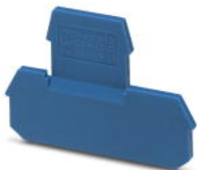
End cover, length: 62 mm, width: 5 mm, height: 40 mm, color: blue

Please be informed that the data shown in this PDF Document is generated from our Online Catalog. Please find the complete data in the user's documentation. Our General Terms of Use for Downloads are valid ( http://phoenixcontact.com/download )