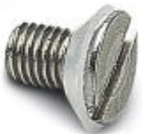
Sealing screw, Size: Countersunk head

Sealing screw - HC-D 7-DS-IP65 - 1686229