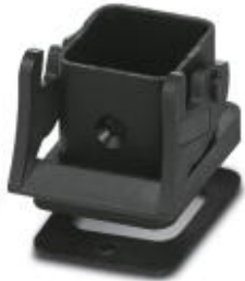
HEAVYCON D7 panel mounting base, with single locking latch, height: 24 mm, straight, PA, black

Please be informed that the data shown in this PDF Document is generated from our Online Catalog. Please find the complete data in the user's documentation. Our General Terms of Use for Downloads are valid ( http://phoenixcontact.com/download )