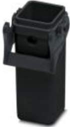
HEAVYCON D7 coupling housing, with single locking latch, height: 60.5 mm, with 1 x M20 gland, PA

Please be informed that the data shown in this PDF Document is generated from our Online Catalog. Please find the complete data in the user's documentation. Our General Terms of Use for Downloads are valid ( http://phoenixcontact.com/download )