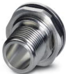
Housing screw connection, Plug, M12, Rear mounting, M15 x 1

Please be informed that the data shown in this PDF Document is generated from our Online Catalog. Please find the complete data in the user's documentation. Our General Terms of Use for Downloads are valid ( http://phoenixcontact.com/download )