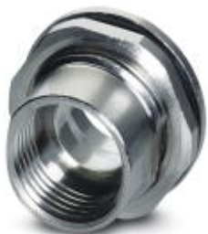
Housing screw connection, Socket, M12, Rear mounting, M15 x 1

Please be informed that the data shown in this PDF Document is generated from our Online Catalog. Please find the complete data in the user's documentation. Our General Terms of Use for Downloads are valid ( http://phoenixcontact.com/download )