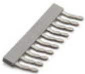
Insertion bridge, Number of positions: 10, Color: gray