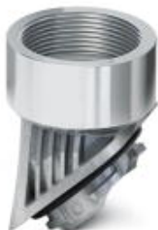
Adapter, aluminum, for EVO housing, NPT-1, 1" thread

Please be informed that the data shown in this PDF Document is generated from our Online Catalog. Please find the complete data in the user's documentation. Our General Terms of Use for Downloads are valid ( http://phoenixcontact.com/download )