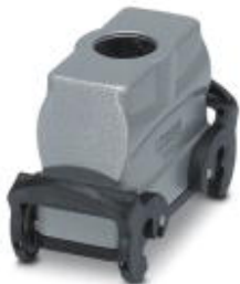
HEAVYCON B16 coupling housing, with double locking latch, height: 82 mm, with 1 x M40 thread, straight cable outlet

Please be informed that the data shown in this PDF Document is generated from our Online Catalog. Please find the complete data in the user's documentation. Our General Terms of Use for Downloads are valid ( http://phoenixcontact.com/download )