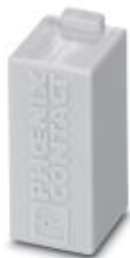
HEAVYCON dummy module, for unused slots in the module carrier frame

Please be informed that the data shown in this PDF Document is generated from our Online Catalog. Please find the complete data in the user's documentation. Our General Terms of Use for Downloads are valid ( http://phoenixcontact.com/download )