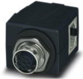
Control cabinet feed-through, M12, 8-pos., A-coded on RJ45 socket, socket input 90°, IP65/67

Please be informed that the data shown in this PDF Document is generated from our Online Catalog. Please find the complete data in the user's documentation. Our General Terms of Use for Downloads are valid ( http://phoenixcontact.com/download )