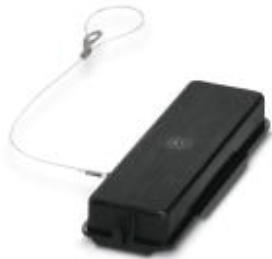
HEAVYCON protective cover, B24, for HC-EVO-B24... supporting base element, for single locking latch, with retaining cord with combination eyelet, IP54

Please be informed that the data shown in this PDF Document is generated from our Online Catalog. Please find the complete data in the user's documentation. Our General Terms of Use for Downloads are valid ( http://phoenixcontact.com/download )