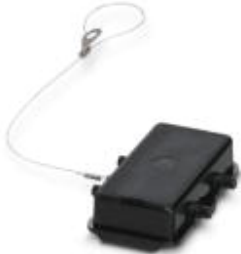
HEAVYCON protective cover, B10, for HC-EVO-B10... supporting base element, for double locking latch, with retaining cord with combination eyelet, IP54

Please be informed that the data shown in this PDF Document is generated from our Online Catalog. Please find the complete data in the user's documentation. Our General Terms of Use for Downloads are valid ( http://phoenixcontact.com/download )