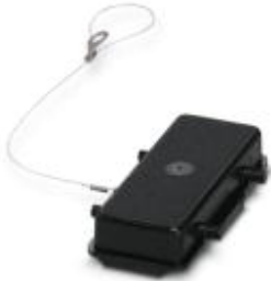
HEAVYCON protective cover, B16, for HC-EVO-B16... supporting base element, for double locking latch, with retaining cord with combination eyelet, IP54

Please be informed that the data shown in this PDF Document is generated from our Online Catalog. Please find the complete data in the user's documentation. Our General Terms of Use for Downloads are valid ( http://phoenixcontact.com/download )