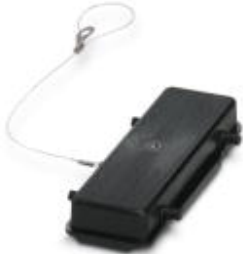
HEAVYCON protective cover, B24, for HC-EVO-B24... supporting base element, for double locking latch, with retaining cord with combination eyelet, IP54

Please be informed that the data shown in this PDF Document is generated from our Online Catalog. Please find the complete data in the user's documentation. Our General Terms of Use for Downloads are valid ( http://phoenixcontact.com/download )