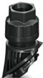
EVO plastic cable gland with bayonet locking; size M40, for 5 conductors with 8.5 mm cable diameter

Please be informed that the data shown in this PDF Document is generated from our Online Catalog. Please find the complete data in the user's documentation. Our General Terms of Use for Downloads are valid ( http://phoenixcontact.com/download )