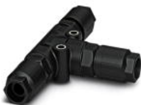
T distributor, QUICKON connection, No. of pos.: 2+PE, 0.5 mm 2 ... 1.5 mm 2 , 690 V, 17.5 A, black, With three QUICKON nuts, Cable diameter: 4 mm ... 9 mm

Please be informed that the data shown in this PDF Document is generated from our Online Catalog. Please find the complete data in the user's documentation. Our General Terms of Use for Downloads are valid ( http://phoenixcontact.com/download )